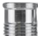
External 1/2" to 22 mm