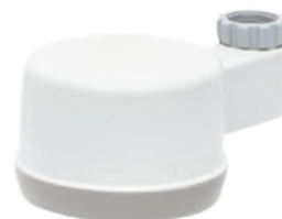
Starter kit legionella tap filter

Various stainless steel adapters for mounting the legionella tap filter on existing faucets of various brands