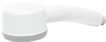
Starter kit legionella shower head